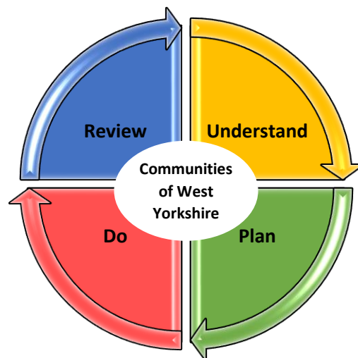
Figure 1 commissioning cycle

Although the cycle is continuous, there are specific areas and timeframes associated with each element